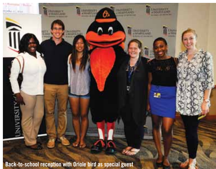
Back-to-school reception with Oriole bird as special guest

John Z. and Akiko K. Bowers Distinguished Professor and Dean, University of Maryland School of Medicine