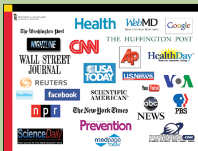
RCN representatives work with Public Affairs to get attention for your research from a variety of media outlets.