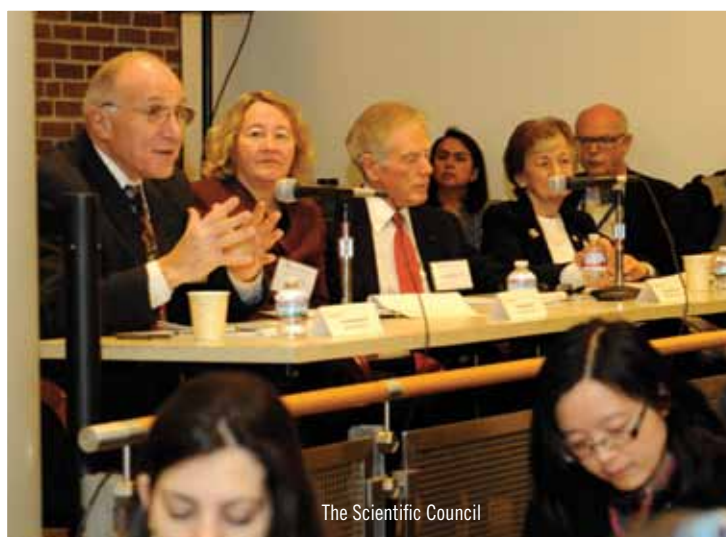
The Scientific Council