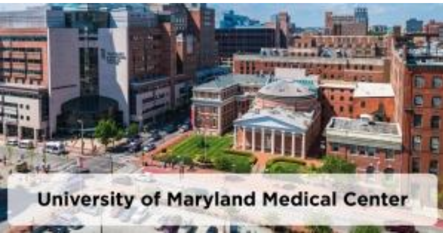
University of Maryland Medical Center