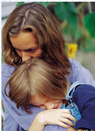
Understanding and Treating Children and Families

Your gift will help our programs maintain the quality of services, training and research needed to improve the lives of children and their families affected by mental health concerns.