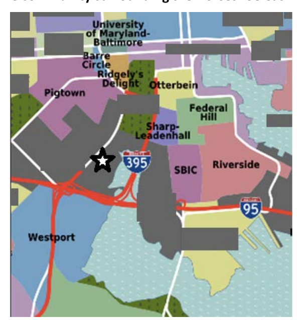
Location of casino shown with a star.