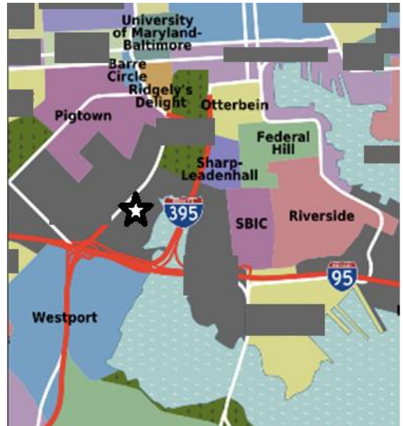
Location of casino shown with a star.