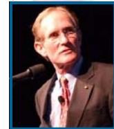
Dr. Peter Agre, the keynote speaker

BioHealth Innovation (BHI), presented various topics ranging from personalizing oncology to developing a test panel for the detection of gene mutations. This symposium was co-organized by the Division of Molecular Pathology, the Program in Personalized Medicine and Genomic Medicine, the Translational Genomics Laboratory at UMSOM, and the Chinese Biopharmaceutical Association (CBA-USA).