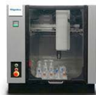
Alchemist DT Screen Maker

CIBR: Center for Innovative Biomedical Resources