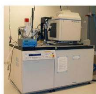
X-ray Diffraction System