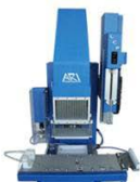
Gryphon LCP Drop Setter