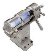
VariMax-HF Optical System