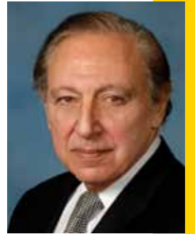
Robert Gallo, MD

► Robert Gallo, MD , the Homer & Martha Gudelsky Distinguished Professor in Medicine, Co-Founder and Director, Institute of Human Virology, presented the keynote lecture on January 28, 2019, titled “HIV/AIDS: Lessons from the Past; Prospects for the Future,” at the Feodor Lynen Lecture and receive the Feodor Lynen Medal during the Miami Winter Symposium 2019 Evolving Concepts in HIV and Emerging Viral Infections hosted by the University of Miami. The prestigious lecture has been given by 28 then or future Nobel Laureates.