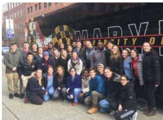
UMCP students from the Department of Bioengineering