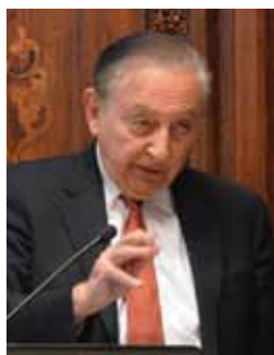
Dr. Gallo at the Venetian Institute of Sciences

► Robert Gallo, MD , the Homer & Martha Gudelsky Distinguished Professor in Medicine, Co-Founder and Director, Institute of Human Virology, presented the keynote lecture titled “Nightmares of an Aging Viral Oncologist” at the Venetian Institute of Sciences during the XV European LeukemiaNet Symposium of Viruses, Genes and Hematological Cancers, held in Venice, Italy, March 19–22.