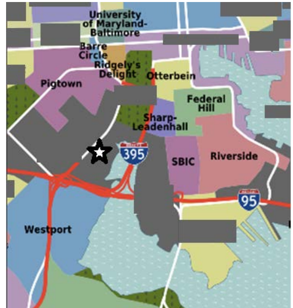
Location of casino shown with a star.