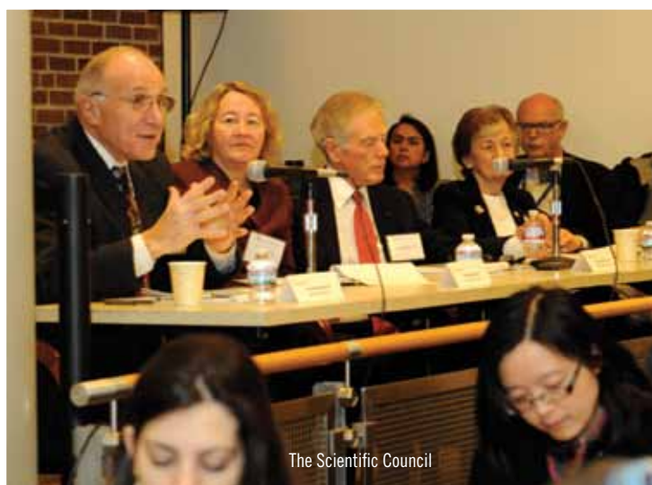
The Scientific Council