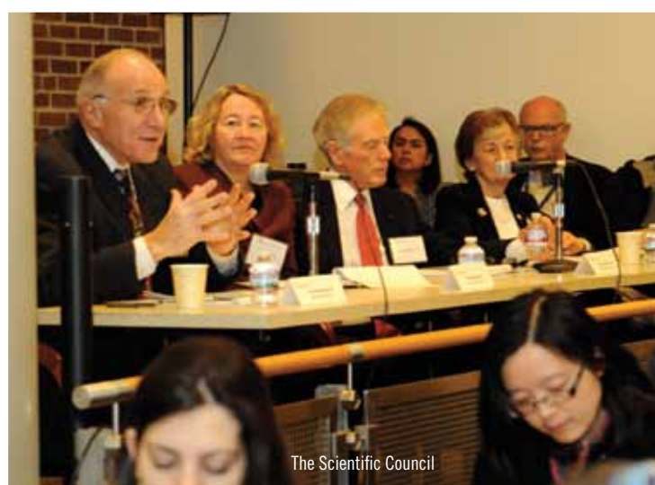
The Scientific Council