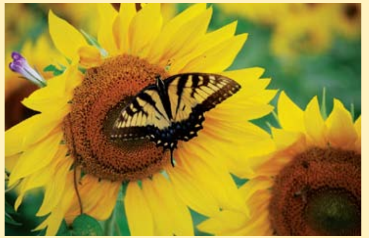
Butterfly on Sunflower. Taken at the sunflower fields in Fallston, Maryland