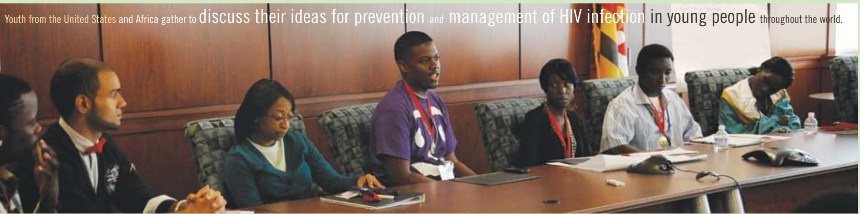
Youth from the United States and Africa gather to discuss their ideas for prevention and management of HIV infection in young people throughout the world.