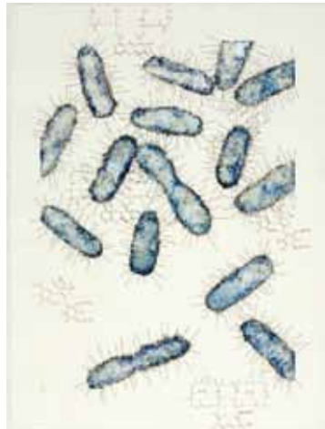
E.coli