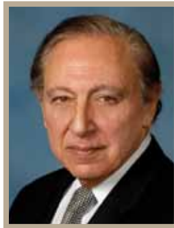
Robert Gallo, MD

Association’s (IMA) Medicine Millennium International Award during the IMA’s 57th Global Annual State Conference in Kovalam, Trivandrum, India, on November 8. The conference was organized by the IMA’s Kerala chapter members. Chief Minister of Kerala, Honorable Oommen Chandy, presented the Award to Dr. Gallo for his “tremendous contribution towards medical sciences and developing medical facilities globally.”